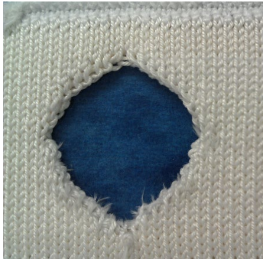
Figure 2: Image of Knitted TPS Material With a Cutout for a Fastener Pass-Through (Source: NASA).

Another potential NASA technology is the use of a knitted TPS (Figure 2) that could potentially be used to form three-dimensional (3-D) and integrated structures. One example listed is that internal struts could be knitted directly into a two-dimensional (2-D) face sheet, making the joint an integral part of the structure. Ablative thermal protection materials made from carbon fiber substrates impregnated with resin, especially phenolic, and various other components have and are being developed for demanding atmospheric entries. The carbon fiber can be short or chopped fiber arranged in a rigid (e.g., FiberForm) or flexible substrate (felts) or woven into 2-D or 3-D structures. Introducing other fibers to make graded or tailored microstructures is being investigated in a current Office of the Chief Technologist program.